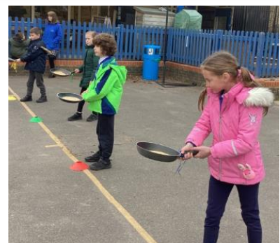
Pancake Day Races!