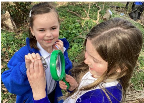
Enjoying Science Week