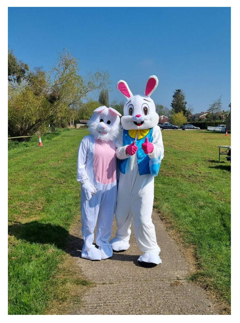
Inaugural Duck Race Easter 2022

Compiled, edited and published for the village on behalf of St Margaret's Church