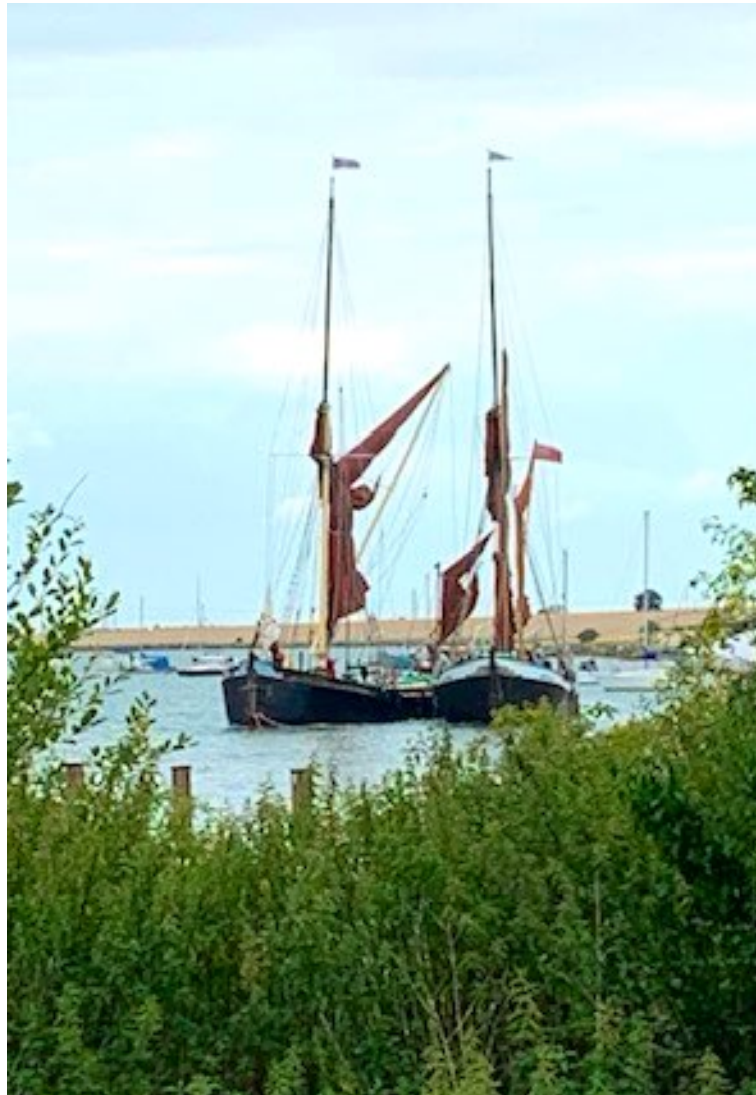
Photo of Thames Barges returning to the village in 2025

Compiled, edited and published for the village on behalf of St Margaret's Church