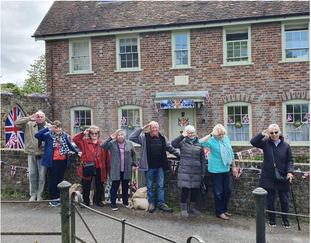
Photo of the Thursday Group (Bereavement Group)

Compiled, edited and published for the village on behalf of St Margaret's Church