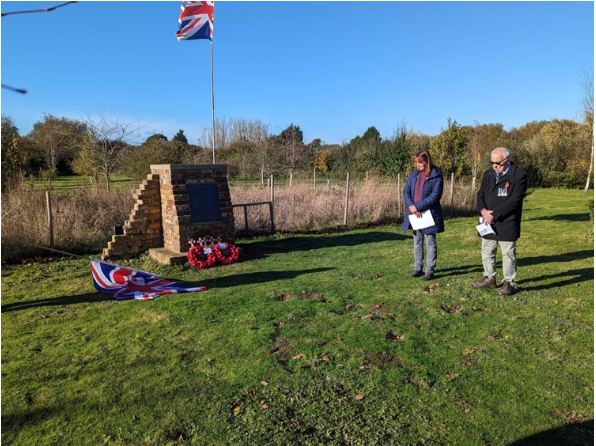
Photo of the 2023 Remembrance Day Service at the Memorial Wood, kindly supplied by Alan Beattie

Compiled, edited and published for the village on behalf of St Margaret's Church