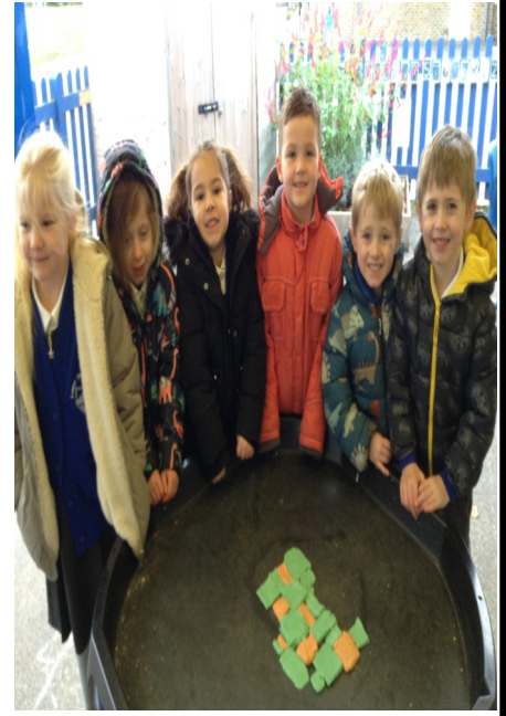
Mondrian inspired shape