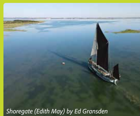
Shoregate (Edith May)