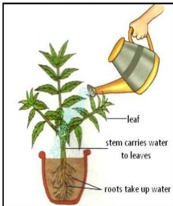
How a plant takes in water.