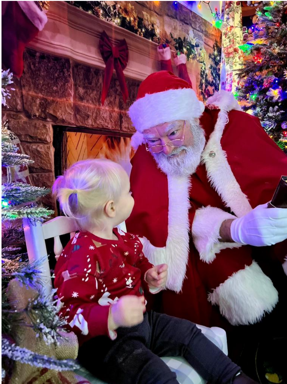
Lunch with Santa 2022

Compiled, edited and published for the village on behalf of St Margaret's Church