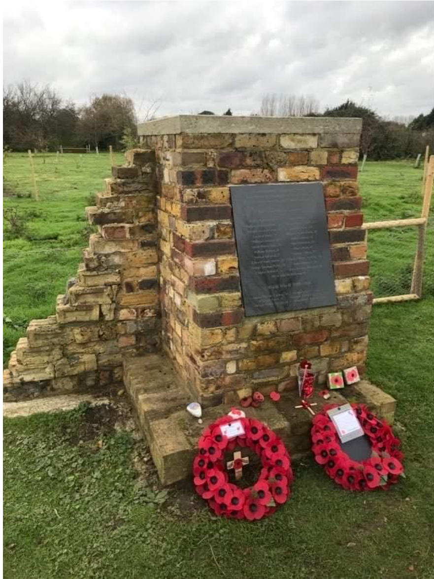
Memorial Wood

Compiled, edited and published for the village on behalf of St Margaret's Church