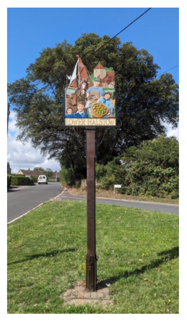
Our beautifully restored village sign

Compiled, edited and published for the village on behalf of St Margaret's Church