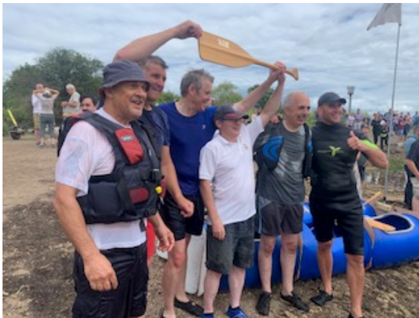
The winning MOPE team