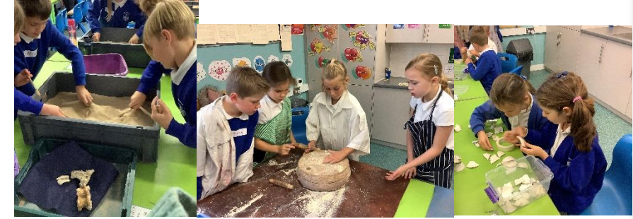
Excavating fossils, grinding grain and reassembling broken pottery during our archaeology day.