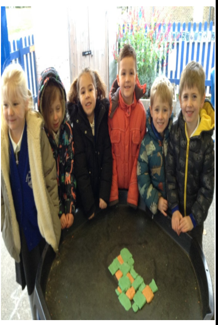
Mondrian inspired shape