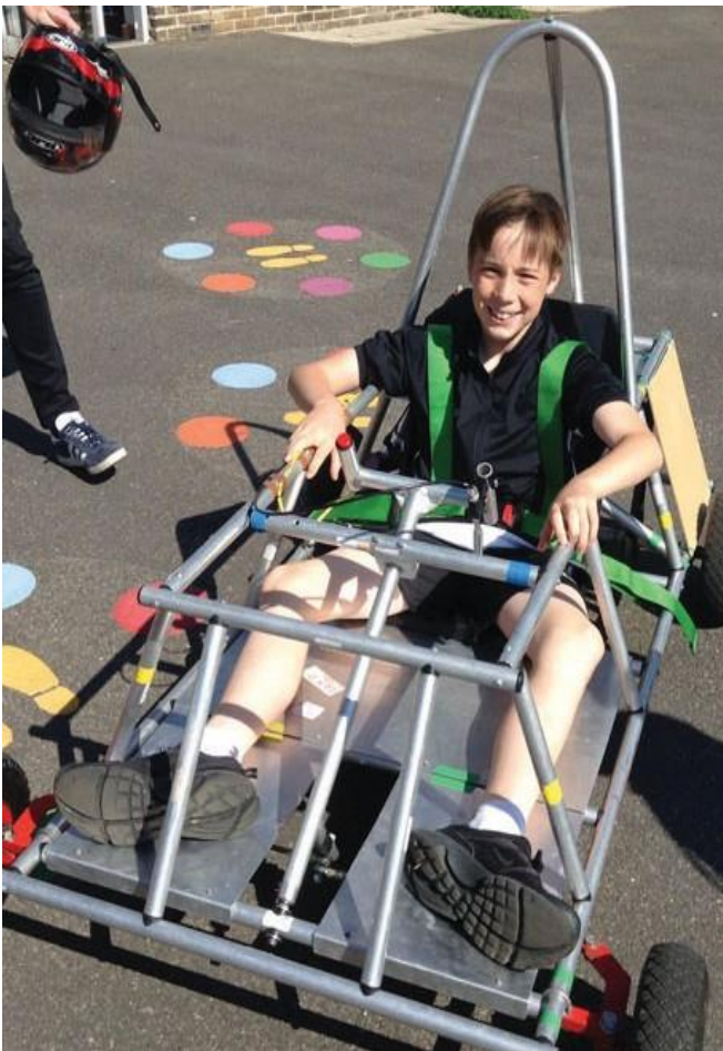
First test run of the go kart before the panels go on

Whilst we are a small school with a family ethos we have high aspirations for all our pupils. Each year more pupils than the Kent average progress to grammar schools and we have established partnerships with a range of organisations in order to provide opportunities for our pupils to experience the wider world. Our annual Y6 World of Work careers event is a great example of the extensive business and educational links we have. Other examples include visiting local universities for events, working with national grid engineers to build and race our own go kart in the MEBP eco-challenge, taking part in mastery workshops led by our secondary partners and our science week where the school hall is transformed into a giant laboratory. As part of the federation, we plan together and share staff with Newington which enable us to continually improve and reflect on our practice. We also work closely with other local schools in our 'alliance' partnership, collaborating on joint initiatives to offer the best possible experience for our pupils.